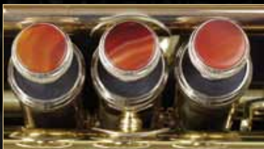
Brazilian Agate - Agate varies in colorization