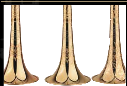
*Bach trombones are available in three handsomely hand-engraved bell patterns: anniversary, standard, and deluxe (pictured left to right).

Mouthpipes for trombone models 12, 16/LT16M are interchangeable. - specifications subject to change