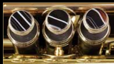
Black and White Sardonix