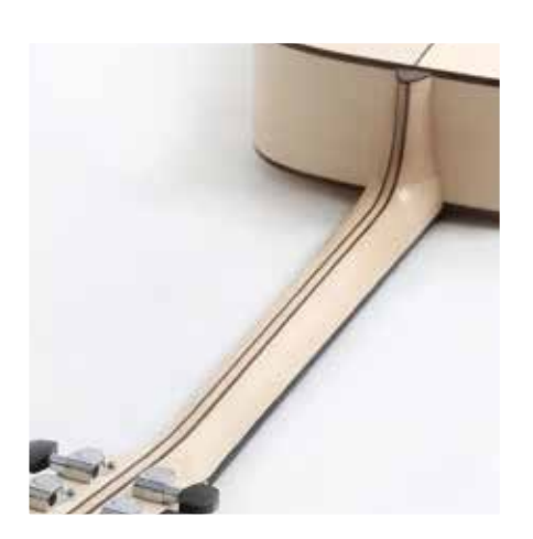
The five-piece maple/walnut neck provides both high stability and a cool look. It is connected to the body by a strong and reliable dovetail joint.