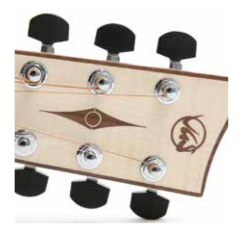
All bindings, logos, the soundhole inlay and the unique Stella Polaris emblem at the 12<sup>th</sup> fret are made from walnut and maple wood.