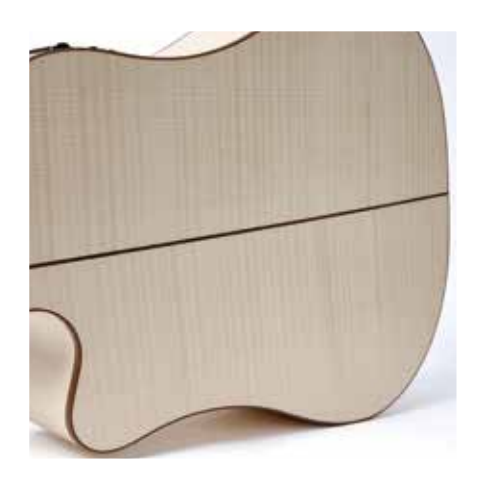
The solid high quality spruce top on a flamed maple body of stunning beauty creates a sound unrivalled by far.